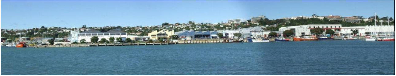
West Quay Ahuriri

Have you ever wanted to photograph a mountain view or other sweeping landscape but found it too wide for a single picture? Well, it's easy to create a panoramic picture of even the widest scene, even with an inexpensive point-and-shoot digital camera..